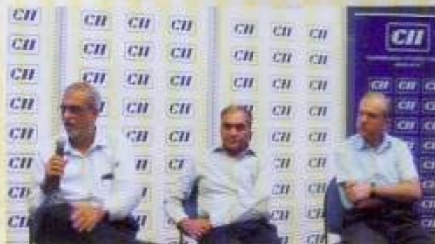
Members' Meet in progress

Increase in Membership during the year was 22.6%