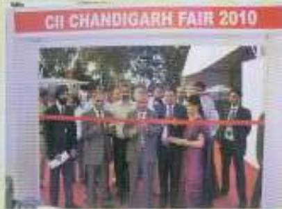
CII CHANDIGARH FAIR 2010