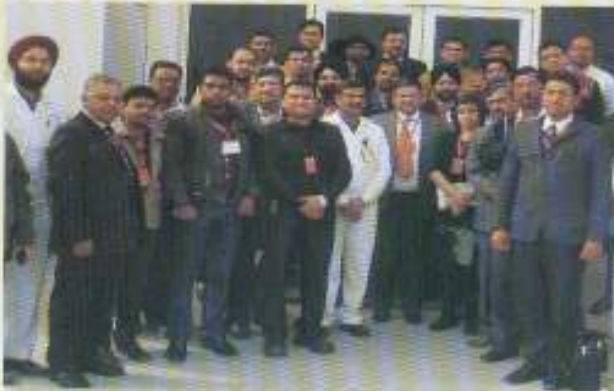
Mission Members with Hero Honda Plant

With an objective to help members learn best practices in manufacturing & automation, beat competition and improve their quality, a two day Manufacturing Best Practices Mission was mounted to SIDCUL, Haridwar. Members got a rare opportunity to visit the plants of: