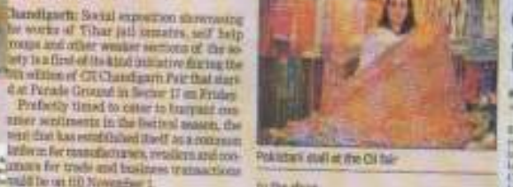
Works by weaker sections special draw at CII fair