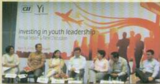
Session on Investing in Youth Leadership in progress

Aimed at empowering the participants with practical knowledge on diverse aspects and challenges of leadership, a session on Investing in Youth Leadership was held. A number of action oriented ideas were presented by eminent panelists from diverse fields.