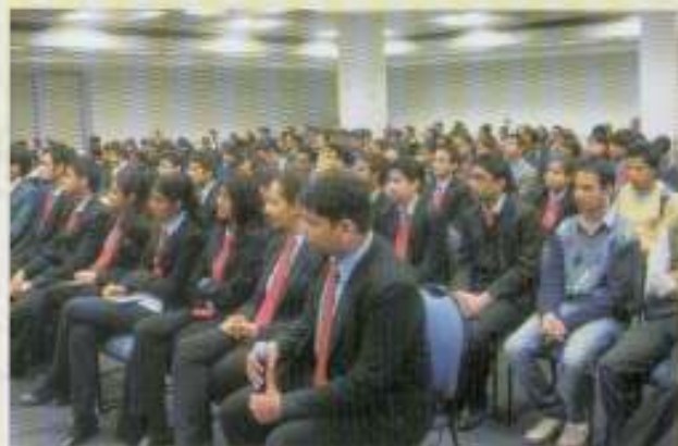
Students at the My Story Session