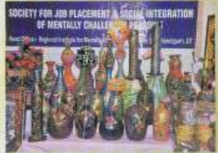
SOCIETY FOR JOB PLACEMENT & SOCIAL INTEGRATION OF MENTALLY CHALLENGED PERSONS