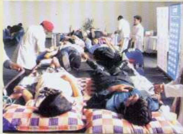
Youngsters donating blood during the camp

Working towards the motive of spreading awareness on health issues and providing related services to underprivileged children, Yi Chandigarh Chapter organized a health campaign. Elements included: