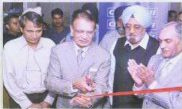
H.E. Mr. Shri Shivraj Patil, Governor, Punjab & Administrator UT Chandigarh launching the CII - Nanhi Chhaan green initiative 2010

CII - Yi sponsorship for the education of 30 deserving under-privileged girls continued.