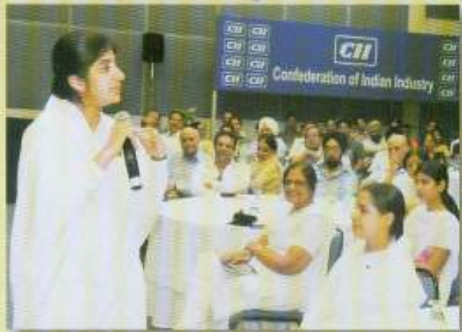
Sister Shivani sharing mantras of stress free lifestyle