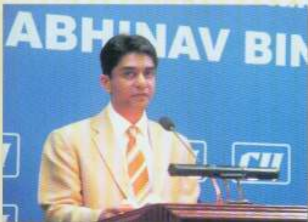
Abhinav Bindra addressing the participants during the session

"We need to be prepared to change five attributes in life - Thinking, Attitude, Action, Habits and Expectations," said Abhinav Bindra, Olympic & World Champion in Air Rifle Shooting, speaking at a session at CII. Talking about focus, hard work and the killer instinct, he encouraged the participants to have self belief in order to achieve their goals.