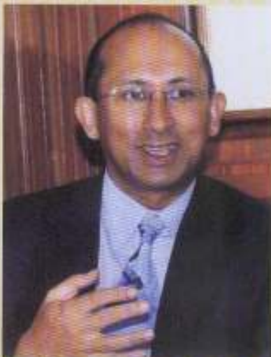
H.E. Mr Peter Varghese, AO Australian High Commissioner to India talking about areas of interaction between the two countries

The area that emerged included bilateral trade, cultural exchange programme, art & film festivals.