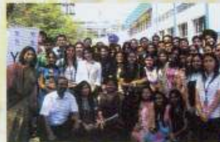
Yi - Amity net students during their visit to Ranbaxy Labs Ltd