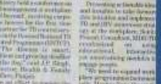
CII for involvement of corporate houses in combating TB