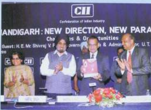
H.E. Mr Shivraj V Patil, Governor, Punjab & Administrator, UT Chandigarh releasing the CII Chandigarh Annual Report 2009-10.

Calling for innovation, collaboration, integration as critical for the development of Chandigarh, H.E. Mr Shivraj V Patil, Governor, Punjab and Administrator, UT Chandigarh opined for a multi stakeholder high level committee to fast track the city's coordinated growth. The Administrator endorsed CII's vision to make Chandigarh the civic capital of India and focus on connectivity and coordinated development.