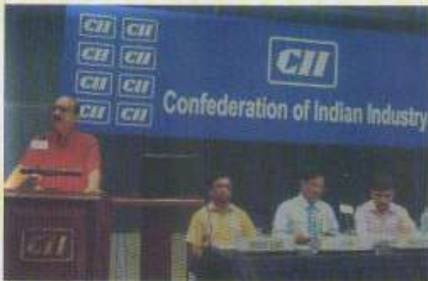
Seminar on MSME in progress

A seminar on MSMEs Development - Path to Progress- was organised to enhance competitiveness of member companies through productivity management & continual improvement through 5S, quality improvements and waste elimination techniques. Progressing with financing options through government grants, special schemes were also discussed. The session saw the participation of MSMEs heads from both manufacturing and services sector.