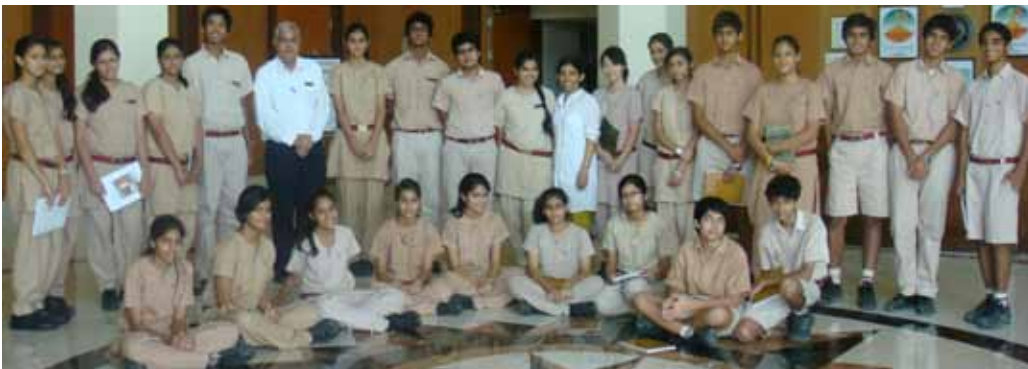
Students at the ITC Green Centre