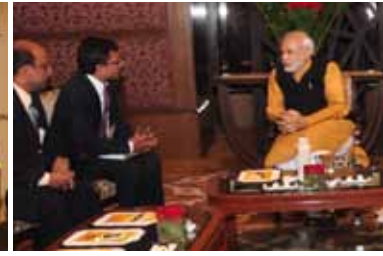
Left: Seminar on 'Doing business with Japan'; Right: Mr Narendra Modi, Chief Minister, Gujarat, interacting with delegates