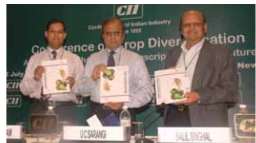
Below: Report on ‘Crop Diversification: A Diagnosis of the Past and Prescriptions for the Future’ at the CII conference on crop diversification; Far below: Innovation Conclave