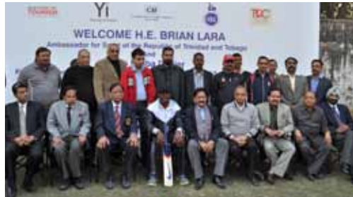
Top: Session with Mr P Chidambaram, Hon'ble Minister of Home Affairs; Middle: Youth consultation workshop; Above: Cricket Clinic with Brian Lara