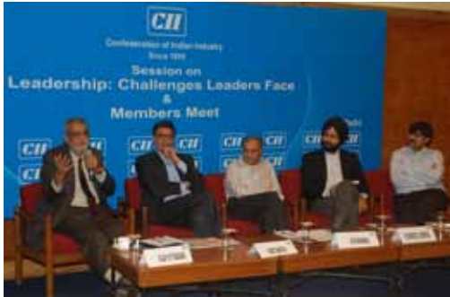
Panelists deliberating at the session on leadership: Challenges leaders face

A meet was organised for the members from the NCR region along with a session on leadership. Key issues discussed were: