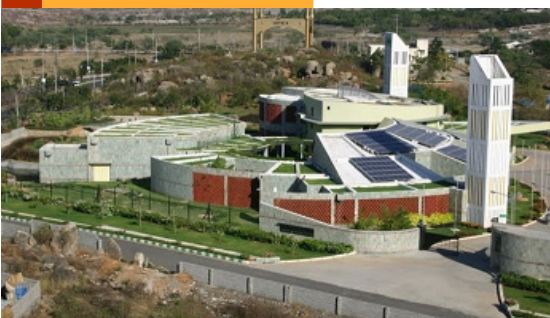
CII— Sohrabji Godrej Green Business Centre

For more details, pl log on to www.greenbusinesscentre.com