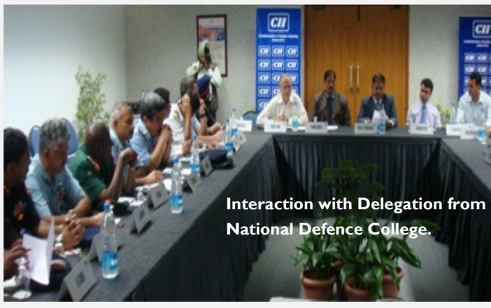
Interaction with Delegation from National Defence College.

Presentations on IT, Pharma and manufacturing sectors were made at the session.