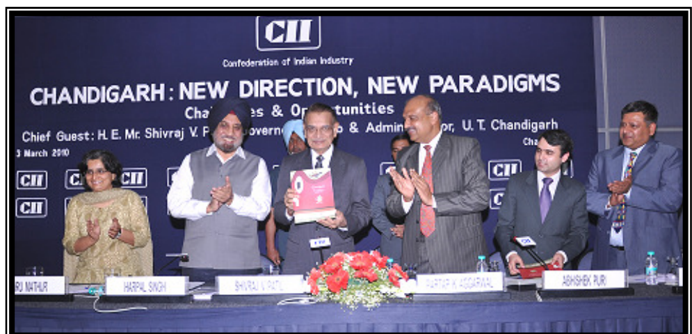
H.E. Sh Shivraj V Patil releasing the Chandigarh Annual Report

The session was attended by 200 delegates form industry, institutions and academia.