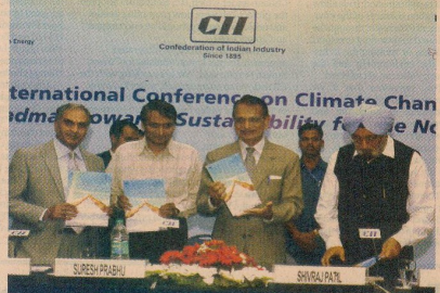
International Conference on Climate Change and Sustainable Development for the North