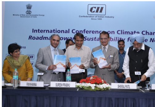
H.E. Mr Shivraj V Patil during the Conference on Climate Change.