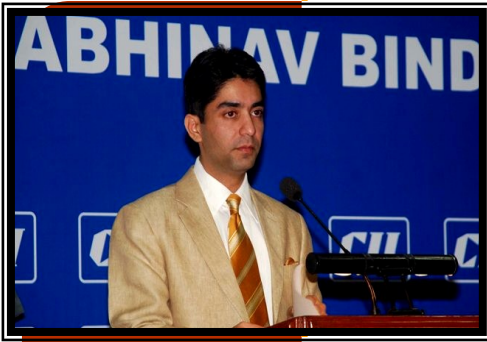
Ace Shooter Abhinav Bindra addressing the participants during the