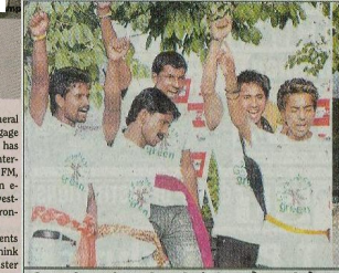
ਸੀ. ਆਈ. ਆਈ. ਵਾਈ ਆਈ. ਚੰਡੀਗੜ੍ਹ ਚੈਪਟਰ ਦੇ ਮੈਂਬਰ 'ਝੀਲ' 'ਤੇ ਨਾਟਕ ਰਾਹੀਂ ਲੋਕਾਂ ਨੂੰ ਵਾਤਾਵਰਨ ਨੂੰ ਬਚਾਉਣ ਦਾ ਸੋਚ