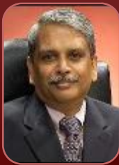
S Gopalakrishnan Vice President, CII & Co-Chairman, Infosys Technologies