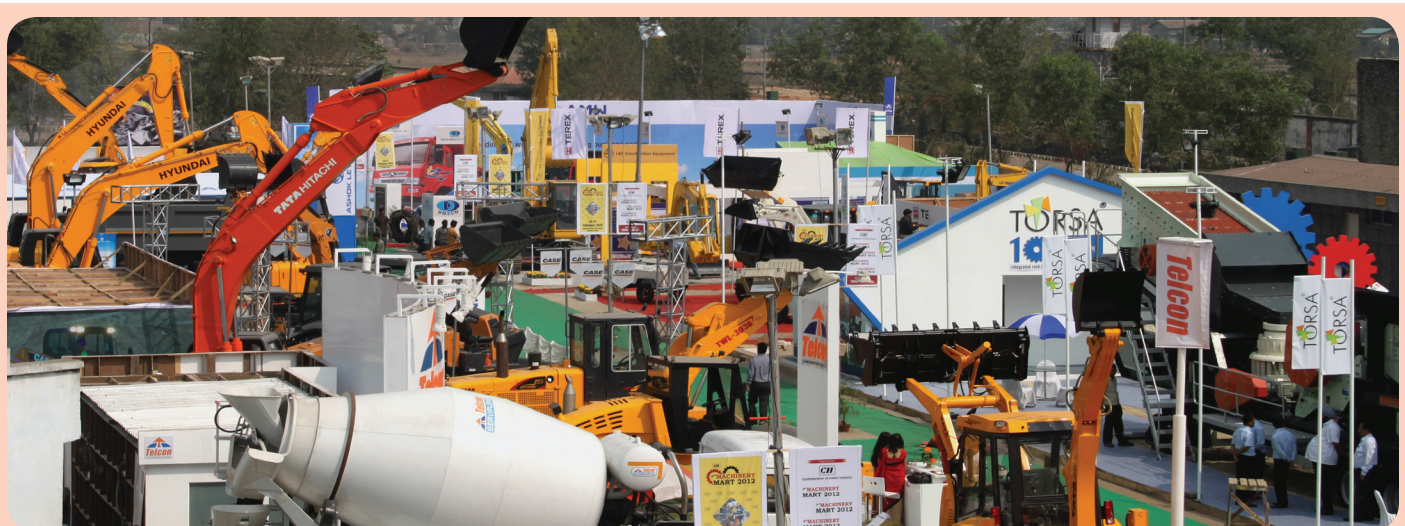
Panaromic view of the exhibition