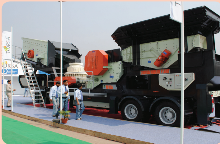
80 TPH stone crushing machine, Torsa Machine Ltd