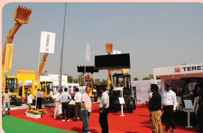
Visitors at the Exhibition