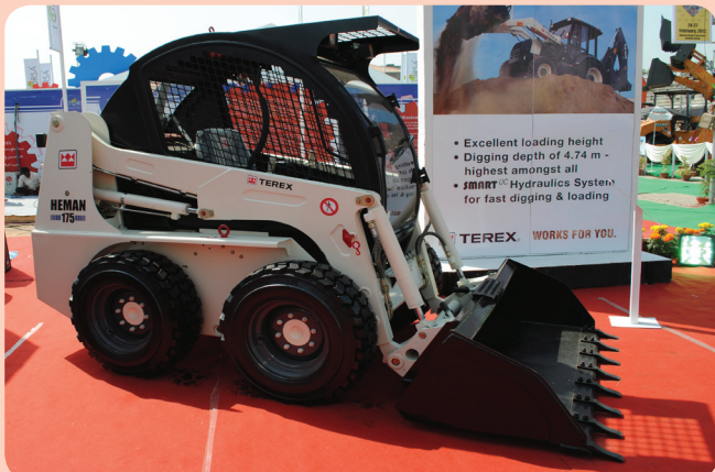
Skid Steer Loader, Terex Equipment Pvt Ltd