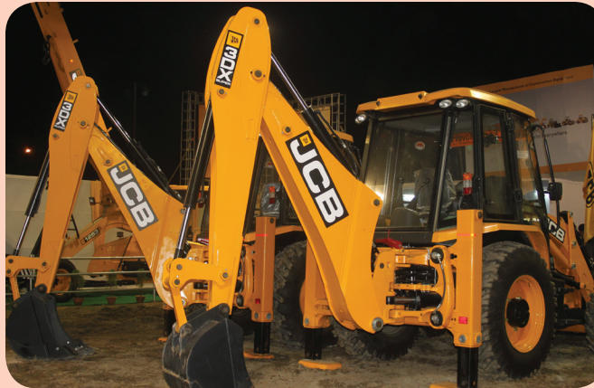
Backhoe Loader, JCB India Ltd

This edition brought in record numbers of visits by stake holders from Government and private sectors. Senior Government officials from department of PWD, Urban Development and State Electricity Boards from the states of Assam, Meghalaya and Nagaland led high level delegations.