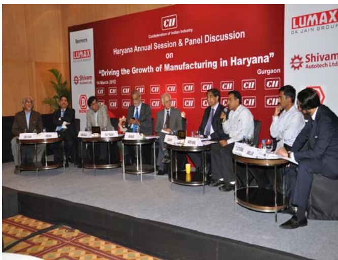
Panelist addressing the delegates at the conference

The workshop was well attended by the delegates from various companies such as Apac sourcing ltd, Aska Equipments, Bergen Systems, Brembo Brake India, CGN & Associates India, EMD Locomotive Technologies, Escorts Agri Machinery, Future Bioscience, Genaxy Scientific Ltd, Healthpoint Services India, Hitachi Metglas Ltd, Jay Bharat Maruti Ltd, K L Steels P Ltd, Komax Automation India, KOYO Bearings India, Lumax Industries Ltd, Mars Industries Ltd