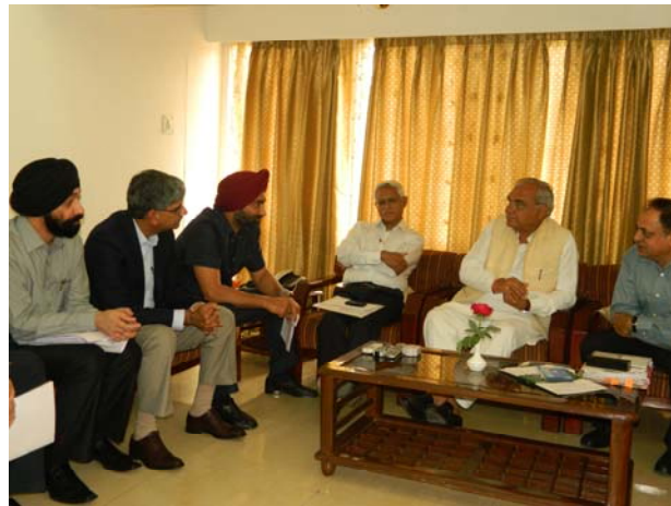
Mr Bhupinder Singh Hooda with the CII Delegation.