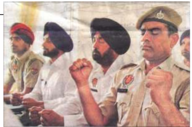
Police officials at the IPR Enforcement session

In order to tackle the rising global threat of counterfeiting and piracy, CII Punjab organized an Interactive Session with Police Officials on Intellectual Property Rights (IPR) Enforcement - Best Practices. The objective is to develop a prolonged partnership between the right holders and the enforcement agencies.