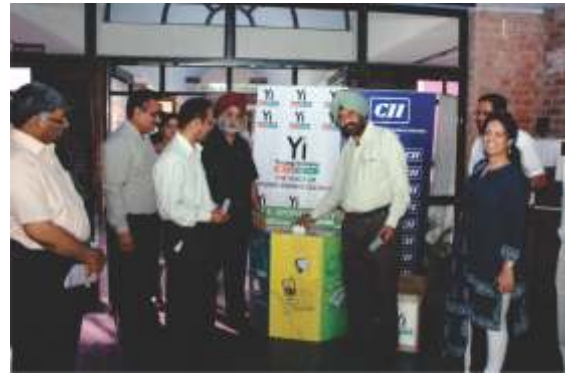
E-waste collection point launched at CDAC Mohali

The tree plantation drive is an initiative of CII to support the Government of Punjab's efforts for greening of Punjab with industry partnership. CII Punjab members would plant over 20,000 saplings this year under this initiative in Punjab.