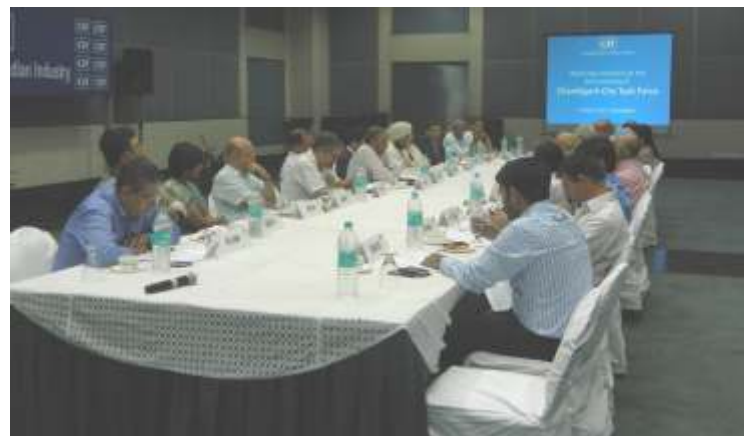
Chandigarh City Task Force Meeting in progress