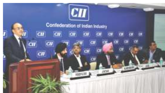
Mr Adi Godrej, President, CII addressing the members