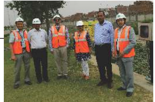
Yi Learning Mission at Delhi Jal Board

CII-Yi Delhi Chapter celebrated “World Environment Day” by organising Learning Mission to Water Treatment Plant of Delhi Jal Board to understand how Water Treatment Plant produces safe and potable drinking water and the best practices that Delhi Jal Board follows towards protecting the environment.