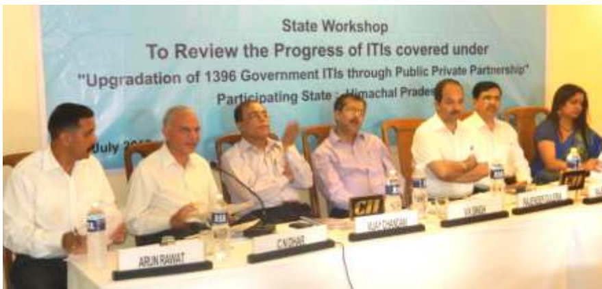
The workshop for ITIs at Nalagarh Fort

Confederation of Indian Industry, Northern Region in association with Directorate General of Employment & Training (DGET) Ministry of Labour and Employment Government of India and Department of Technical Education, Government of Himachal Pradesh organised a State level ITI Workshop to sensitize the principals and IMC members of 33 State Level ITIs of Himachal on 'Upgradation of Govt. ITIs under Public Private Partnership Scheme' and its implementation process. The 4 ITIs of Himachal shared the best practices and success story of their achievements.