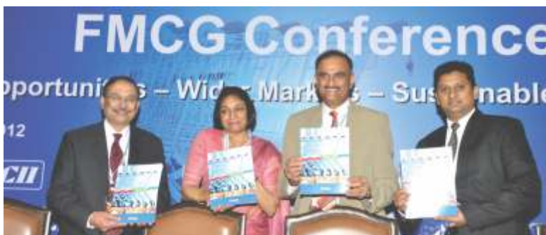
Release of the CII- Y Factor Report: FMCG Sector – New Opportunities

- Mr Arun Maira, Member - Planning Commission, GOI