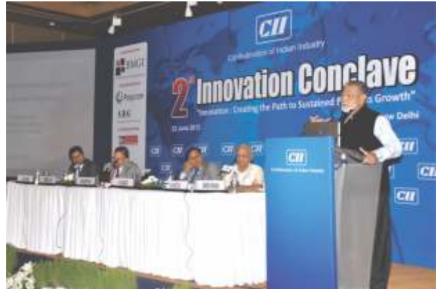
The 2nd Innovation Conclave in progress