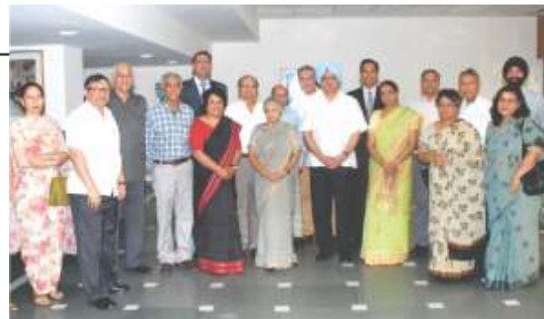
Sheila Dikshit, Chief Minister of Delhi, with CII Delhi Task Force members and senior officials of the Delhi Govt

The CII Delhi Task Force members led a 17-member delegation to meet Mrs Sheila Dikshit, Chief Minister of Delhi. The group presented key suggestions of the CII Delhi Task Force in the areas of Traffic Management, Water & Sanitation, Energy Conservation, and the Delhi Master Plan 2021. The suggestions of the Task Force were highly appreciated by the Chief Minister.