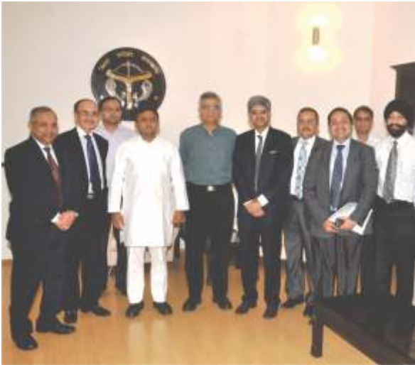
CII delegation with Akhilesh Yadav, UP CM