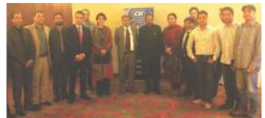
Dr M Veerappa Moily, Union Minister for Corporate Affairs, with CII Members at Srinagar

He also added that his ministry would explore the possibility of holding an "Investment and Governance Meet" in Srinagar.