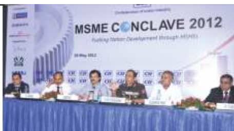
MSME Conclaves in progress