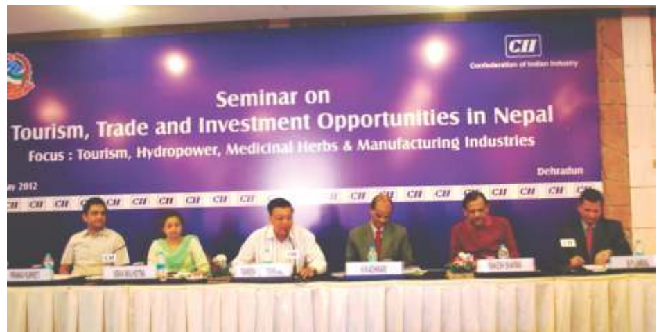
Session on Tourism & Investment Opportunities in Nepal underway in Dehradun