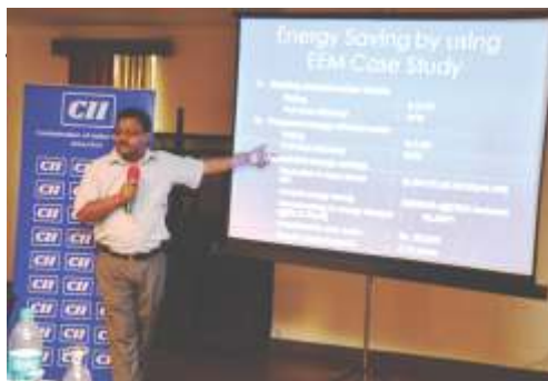
An expert addressing delegates at the workshop