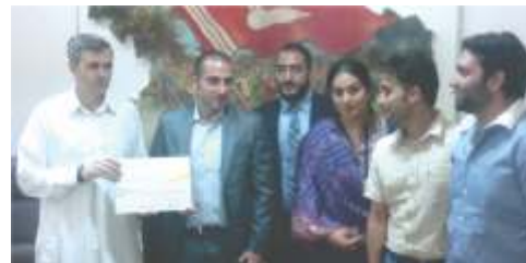
Chief Minister Omar Abdullah along with CII members

A CII delegation led by Mr Waseem Trumboo called on Mr Omar Abdullah, Chief Minister of J&K. Mr Trumboo gave a brief presentation on eco-sensitive zone notification. In the presentation, CII suggested that a stakeholder committee should be formed by the Govt of J&K along with representatives from CII. The chairman suggested that a high-level state government delegation, along with CII members, should meet the Union Minister for Environment and Forests.