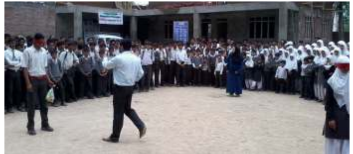
Mock Drill in progress