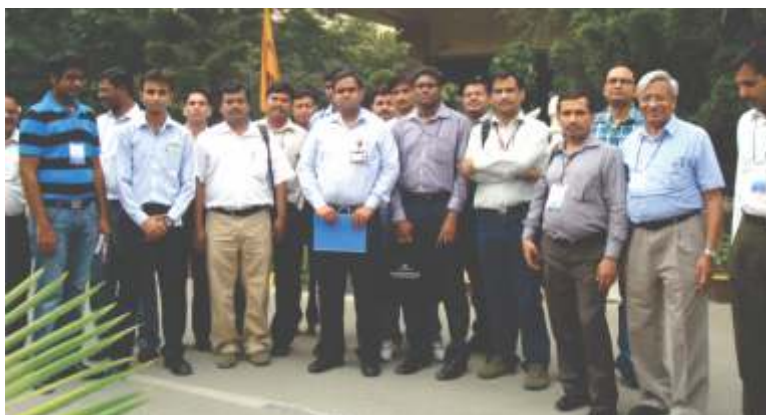
Delegates outside the Mahindra plant in Pantnagar