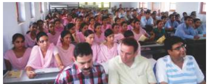
Students and Industry members attending the session