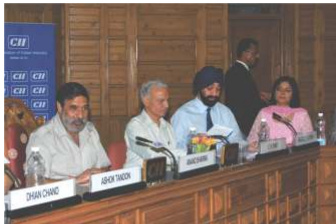
Anand Sharma interacting with CII members in Shimla

Responding to the members, Mr Sharma assured the industry leaders for all possible help and support and urged CII to prepare a note on pending issues with various ministries of Government of India. Mr Sharma agreed to pursue the issue of water scarcity in Parwanoo and development of Railway Network in HP on priority basis.