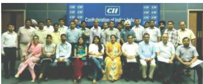
Participants at the Workshop on Challenging Conversations