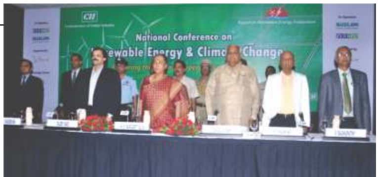
Speakers of the inaugural session standing for the national anthem during the conference