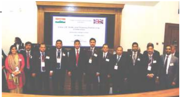
Mission Delegates during Education & Skill Development Mission to UK

The delegates attended important meetings and Education and Skill Development Conference organised by Indian High Commission on 28 May 2012. They also benefitted from the one to one meetings with important Universities and institutions including University College London, Kings College, Queen Marry College, College of Law, Chelsea College, Prospects College, Anglia University, Brunel University, Goldsmith University, etc.