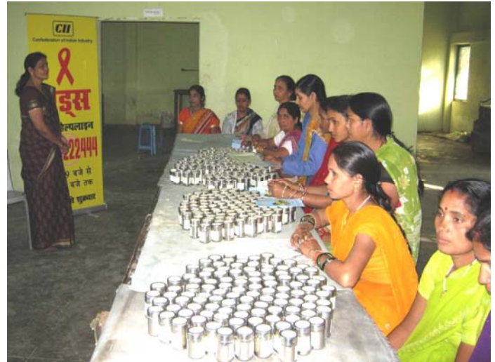
Exclusive HIV/AIDS awareness sessions conducted at Meghdoot Gramodyog Sewa Sansthan