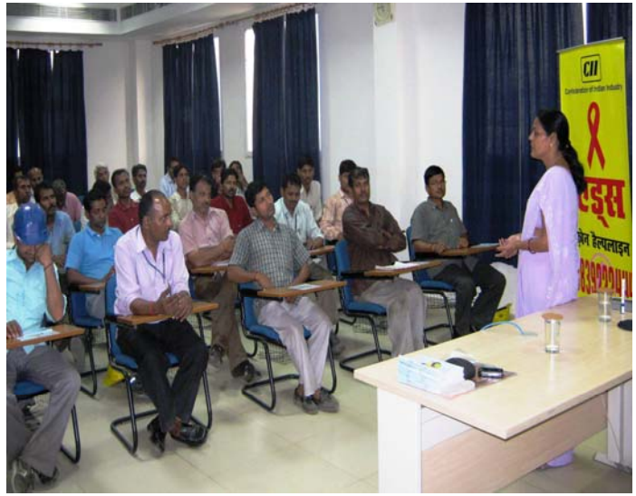
HIV/AIDS awareness sessions in progress