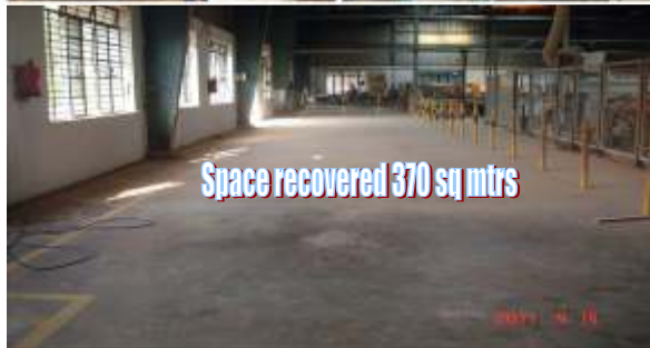
EMPTY SPACE CREATED IN SHOP FLOOR

made available for additional work was to the quantum of 370 Square metres. Hardware, tooling recovery alone amounted to Rs 3.5 lakhs, as a result of the re-layout. There was a substantial improved thorough feed time as well.