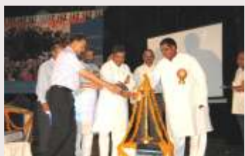
Ground Water Day