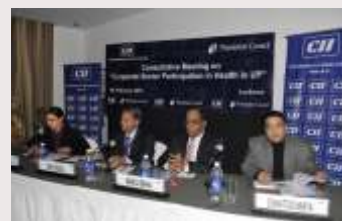
Corporate sector Participation in health