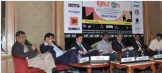
Dignitaries at EXCON 2009

As a run up to Excon 2009, India's largest trade fair on construction equipments & construction technology a road show was held in Lucknow. CII organized Excon 2009, in association with Indian Earthmoving and Construction Industry Association Ltd (IECIAL), at Bangalore.