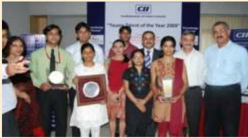
Winners pose at Young Talent of the Year 2009

With the objective to assimilate fresh ideas from the young talents to fulfill the state's objectives, a debate competition was organized in association with WLC College India, Lucknow. The topic of debate was "Will facilitation of Industrial Development lead to fulfilling the State objective: 'Sarvjan Hitaay, Sarvjan Sukhaay'?"