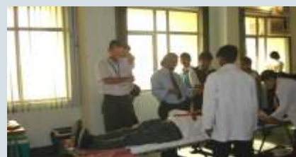
Blood Donation Camp at Noida