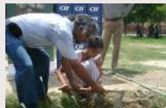
Tree Planting at Noida