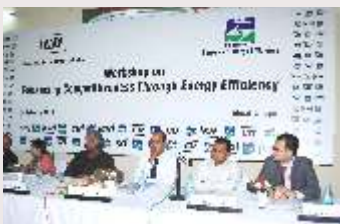
CII - BEE Energy Efficiency Session