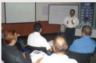
Session on water management techniques