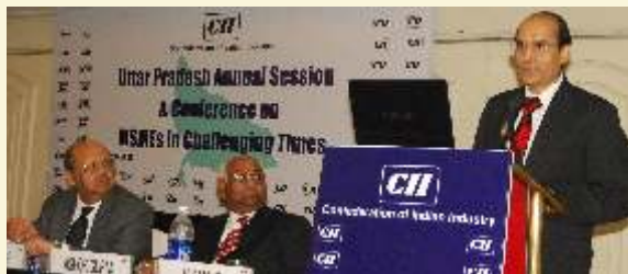
Uttar Pradesh Annual Session in progress