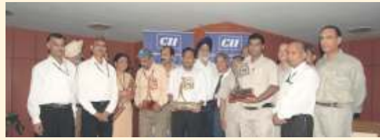
Participants of 22nd QC Competition

In an attempt to recognise the industries initiatives to enhance quality while handling different projects, CII Uttar Pradesh State Council organized its 22nd Quality Circle (QC) Competition in Lucknow.