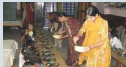
World Food Day