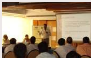
Workshop on environment, health and safety

CII Uttar Pradesh focused its initiatives on the conservation and management of environment, water and energy. In an effort to conserve and protect these finite resources, the State Council provided the stakeholders various platforms to work on the sustainability of these depleting assets.