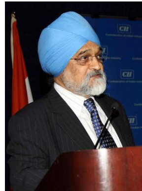
Montek Singh Ahluwalia, Deputy Chairman, Govt of India- Planning Commission addresses the gathering as Guest of Honour