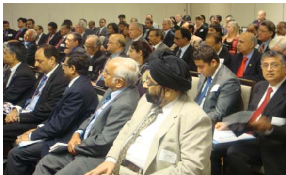
Members of the CII delegation, members of Greater Houston Partnership and the Indo-American Chamber of Greater Houston on 17 November in Houston