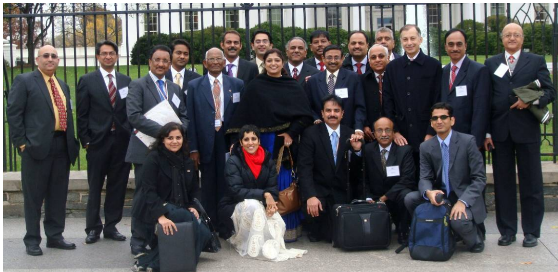
CII delegation on the Business Mission to USA on 23 November 2009 in Washington DC