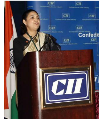
Meera Shankar, Ambassador of India to USA makes special remarks at the CII MoU Signing Ceremony

Indian investments in the US have been rising consistently and the Indian corporate are keen to collaborate further. The CII MoU Signing Ceremony marked the commitment of the two countries coming together at the corporate level to deeply engage in economic collaboration and strengthen institutional linkages.