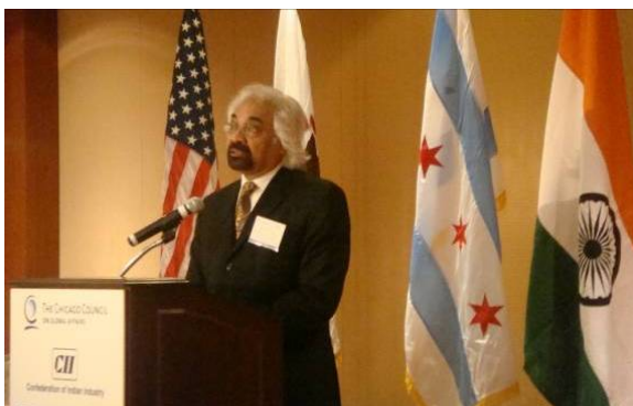
Sam Pitroda, Advisor to the Prime Minister of India on Public Information Infrastructure and Innovation delivers a Keynote at the conference in Chicago