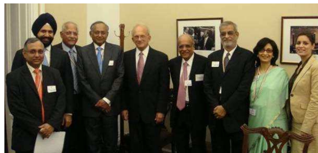
Members of the CEOs delegation with Congressman Howard Berman on 17 June in Washington DC