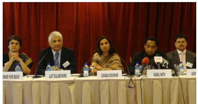
Minister Kamal Nath (2 nd from right) at the joint CII-ICICI-JM Financials Session in New York

At a Session jointly organized by CII, ICICI and JM Financials, Mr Kamal Nath highlighted opportunities in India's infrastructure sector and urged corporate members with expertise in infrastructure development to invest in upcoming Indian projects. Opportunities for infrastructure financing were also discussed in detail. The tremendous turnout at the Session was testimony to the interest and opportunities being generated in India's infrastructure sector.