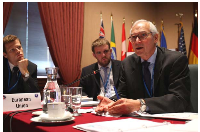
Mr Jamshyd Godrej, representing India at the Major Economies Business Forum