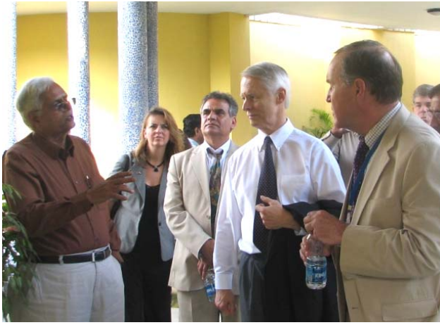
Members of the delegation led by Secretary of State Sam Reed, State of Washington at a guided tour of the Green building facility at Hyderabad