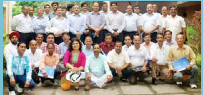
First batch of trainees of FDP at Tata Motors