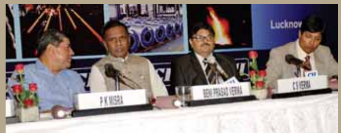
Mr Beni Prasad Verma, Minister of Steel, Government of India at the conference with senior dignitaries