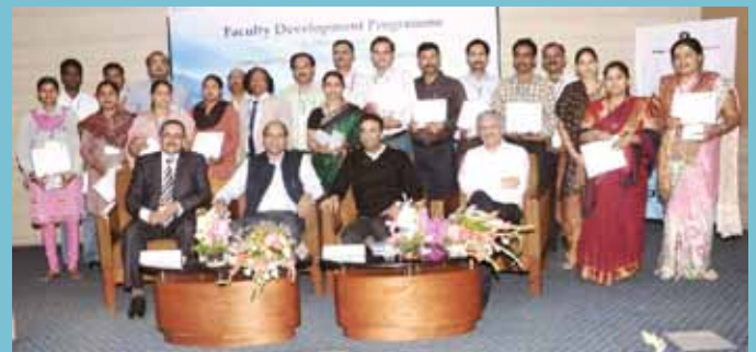
COPA instructors of ITIs at TCS, Lucknow

Both auto and IT sectors are fast growing sectors and face a skill deficit.