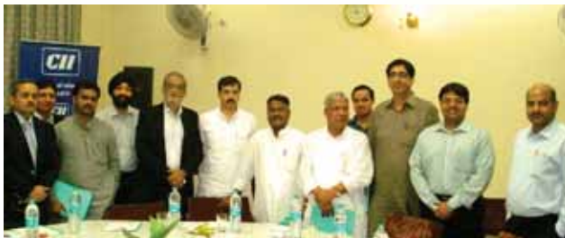
Hon`ble Members of Parliament from Uttar Pradesh with CII members

The meeting focused on strategic imperatives for the development of Uttar Pradesh and what role CII could play. The MPs stressed on the need to develop the entrepreneurial skill of the youth and to facilitate micro entrepreneurs for generating employment opportunities in the State.