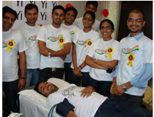
Blood donation camp at the School of Petroleum Management