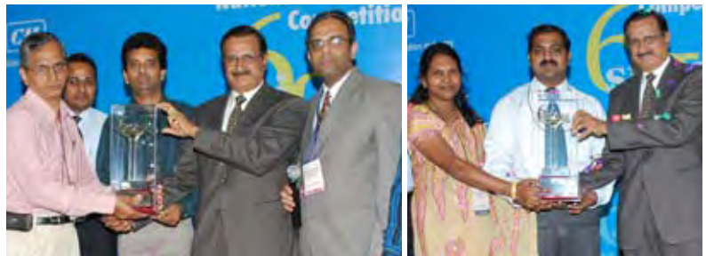
Winning teams from Max New York Life Insurance (left) and Brakes India (right)