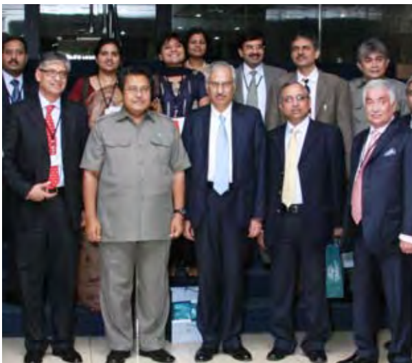
CII delegation with Fahmi Idris

CII's 'India Evening,' showcasing Indian cultural performances and cuisine, was attended by key officials from the Indonesian government, diplomatic corps and media.