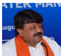
Kailash Vijayvargiya, Minister for Commerce & Industry, Madhya Pradesh

Ireland. The session also described the investment scenario in Ireland and how Indian business communities can, through engagement with the Irish Government, strengthen their European footprint.