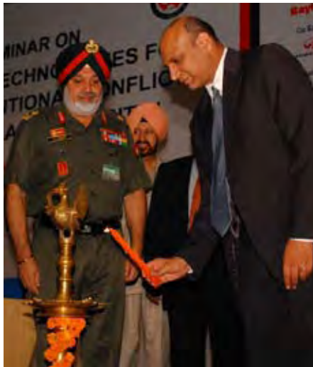
MM Pallam Raju, Union Minister of State for Defence, and Lt Gen Jasbir Singh AVSM, VSM, DG Infantry

Mr Raju said that the internal security situation in the country has a bearing upon the investments, industry and employment and indicators of human development. Lately, the government has taken initiatives to strengthen the internal security apparatus. New centres for rapid response are being set up in key cities all over the country. In order to raise the economic growth of the country, India must provide peace and mental security to investors so that they are confident about bringing in much needed