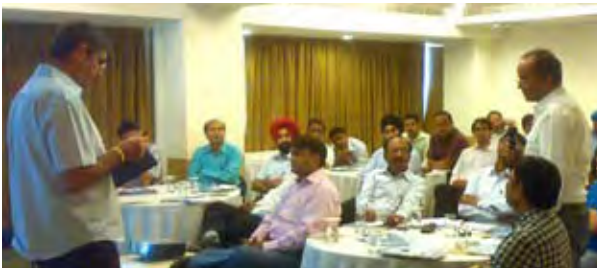
Training Session on Theory of Constraints

Since the early 1980s, the applications of the Theory of Constraints (TOC) have generated good results for