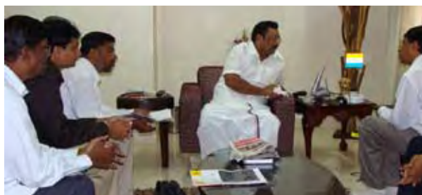
M K Azhagiri, Union Minister for Chemicals & Fertilizers, with CII members