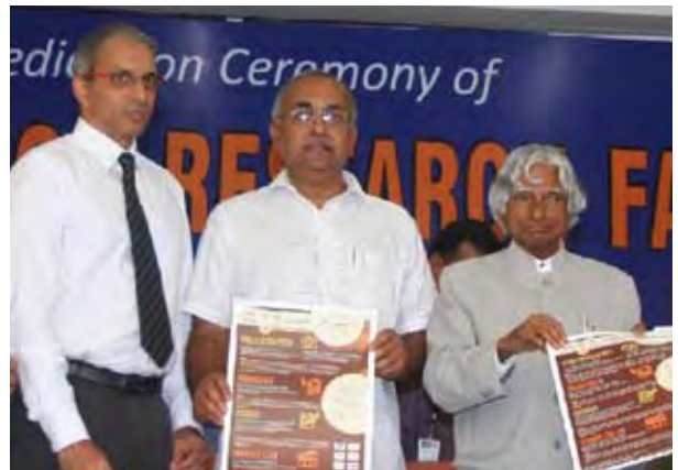
Dr APJ Abdul Kalam at a Yi event in Coimbatore

CII and Yi came together to organize 'DREAM Coimbatore' – a prelude to CII's District Development Conference scheduled for 30 – 31 October. The Dream Coimbatore project intends to engage different sections of society through a painting competition, essay writing competition, short film contest and photography contest. CII - Yi would print around 3000 posters and send them to many associations, schools, colleges, members of CII and Yi, retail outlets etc. The poster was formally released by Dr A P J Abdul Kalam, former