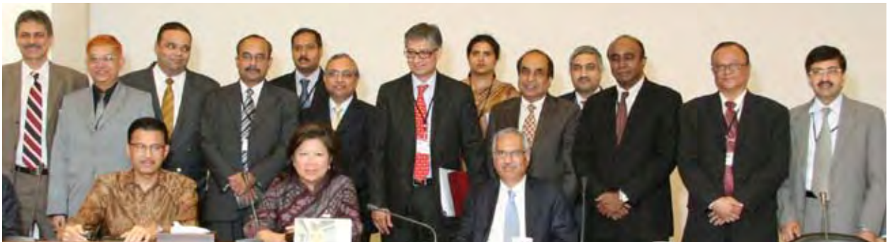
Mari Elka Pangestu, Minister of Trade, Indonesia, with the CII delegation