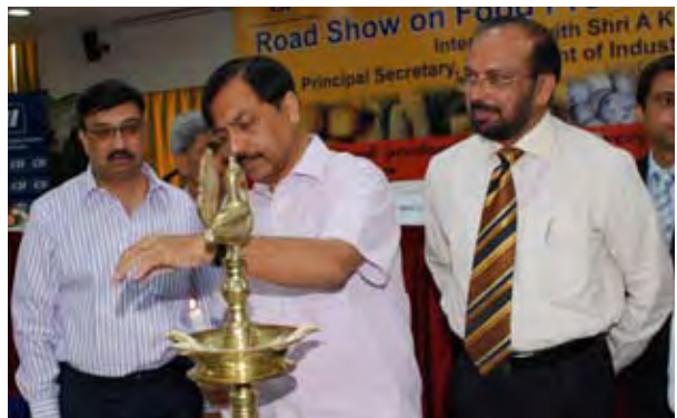
At the Road Show on Food Processing Policy of Bihar

The Government of Bihar has recently launched its Food Processing Policy. To invite investors and entrepreneurs to explore agri-business opportunities in this sector in Bihar, a road show was organised in Ranchi.