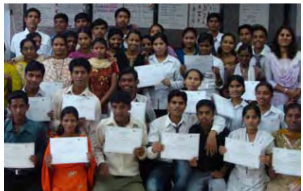
Valedictory Session of the 11th batch of the Yi PCC LABS in Pune

20 August: Yi PCC LABS successfully completed its 11th batch of LABS (Livelihood Advancement Business School) with a valedictory session featuring a skit in English on Global Warming.