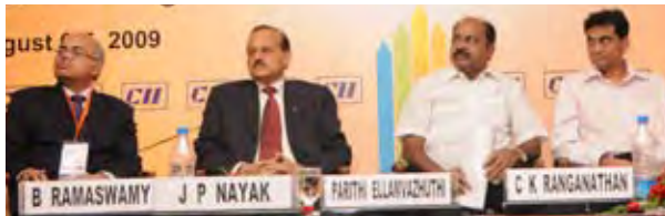
Suminfra 2009, Chennai

The 7th edition of Suminfra 2009, supported by the Government of Tamil Nadu, unveiled opportunities for industry in infrastructure development in the Southern Region. The conference highlighted the risk perceptions and concerns of industry which need to be addressed; helped financial institutions understand critical issues related to Infrastructure projects and showcased private sector experiences with PPPs in Infrastructure.