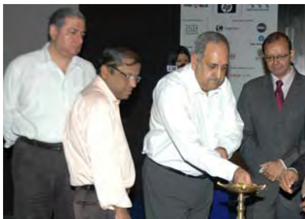
ICT East 2009 in Kolkata

The Minister released a CII Discussion Paper titled 'West Bengal ICT Sector – Current Status and Way Forward.'