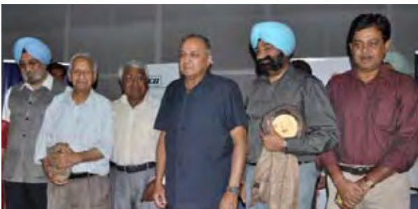
Convention on Wah! Chandigarh

A 3 month long campaign celebrating the spirit of Chandigarh, a joint initiative of CII and UT Administration, kicked off on a high note with the 'Convention on WAH! Chandigarh' receiving a huge response among the citizens of Chandigarh. Gen (Retd) Dr S F Rodrigues, PVSM, VSM, Governor, Punjab & Administrator, U.T. Chandigarh, delivered the special address during the special plenary on 'Making Chandigarh the Civic Capital of India.'