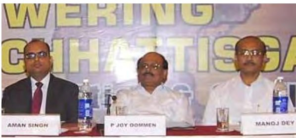
Conference on 'Powering Chhattisgarh'