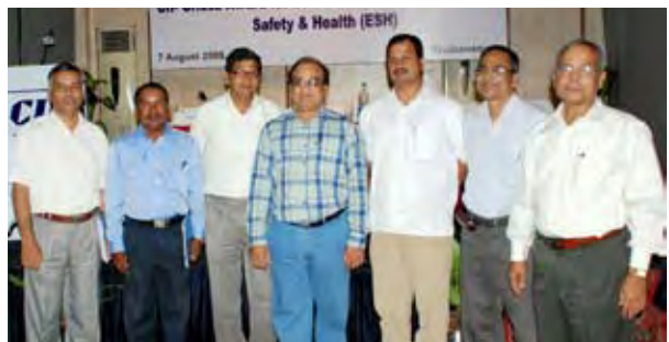
ESH award- winning team of OPGC

Orissa Power Generation Company was declared the winner at the 5th state-level competition on 'Best Practices in Environment, Safety & Health'.