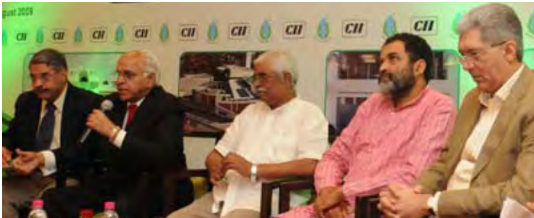
Session on Green Buildings in Bangalore

Bangalore: An interactive session on the Green Building movement with government, industry and professionals was held on 8 August. The day was marked by a panel discussion on the role of various stakeholders in advancing the green building movement in India.