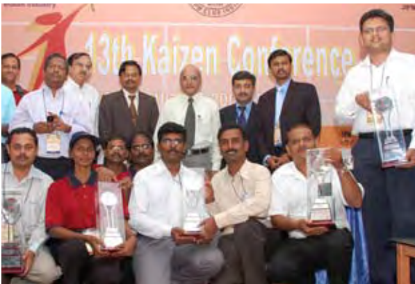
The Kaizen Conference winners