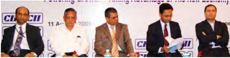
Session on the New Economy