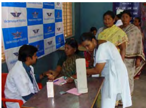
Medical Camp in Madurai

Organized with Apollo Specialty Hospitals & Honeywell Technologies Solutions Lab, the medical camps at T.Vaiyathan and Karumpalai vVillages helped create awareness about preventive healthcare among the villagers.