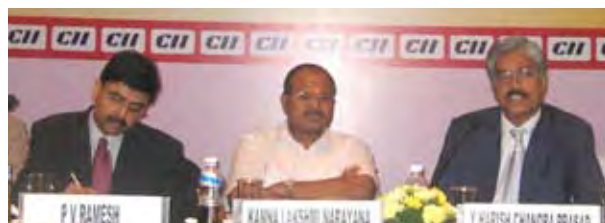
At Man'exe 2009 in Hyderabad

With the theme of 'Business Growth Strategies in the Economic Downturn', the conference focused on an innovative response to the dominant concern; perspective of the financial sector in facing the downturn and HR interventions during the downturn.