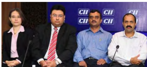
Seminar on International Financial Reporting Standards in Kochi

The seminar, with Ernst & Young as the Knowledge Partner, helped to increase awareness on this important development while guiding industry on the steps involved in the adoption of IFRS, the impact of IFRS on businesses and other related aspects.