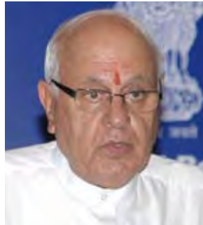
Dr Farooq Abdullah, Union Minister for New & Renewable Energy

Dr Farooq Abdullah urged the hospitality industry, which is one of the major energy and water intensive sectors, to maximize the utilisation of renewable energy sources to reduce the demand-supply gap. He also shared international examples of the benefits of renewable energy in the hospitality industry, and assured that MNRE and the State Government will proactively