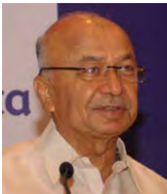
Sushil Kumar Shinde, Union Minister for Power