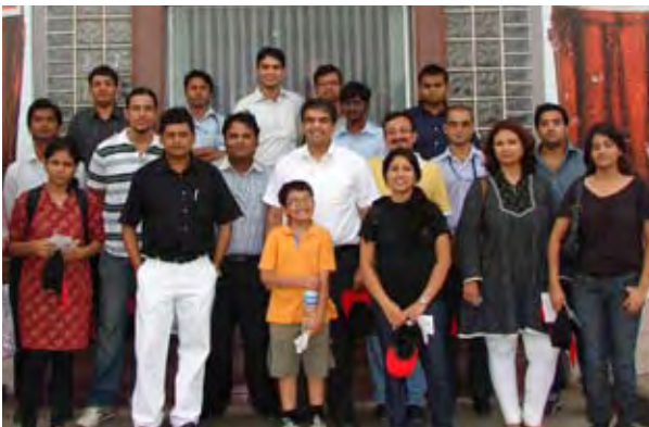
Yi members at the Coca-Cola factory in Goblej village

1 August: A 35-member Manufacturing Excellence mission visited the Coca Cola plant at Goblej village near Ahmedabad, to understand the leadership, teamwork and sustainability aspects of Coca Cola India.