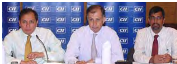
Central Gujarat Zonal Members' Meet