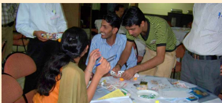
Delegates doing the practical exercises