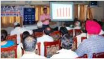
Representative from HP State AIDS control society taking the awareness session

26, 27, 28 & 30 March 2009: Himachal Pradesh