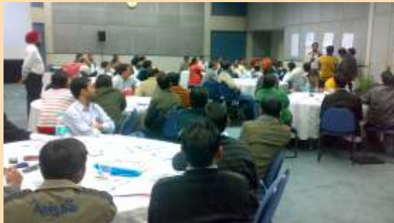
Delegates participating in the practical exercises during the workshop 20 November 2009: Chandigarh

With a backdrop to develop and bring the thought process of future leaders and of their organisations on the same level, CII organized a Workshop on 'How to Develop Supervisory Skills'. The delegates learned: