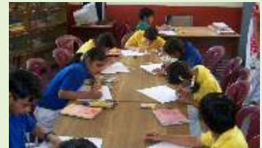
Group of children who participated in the painting competition

Poster making Competitions on water Conservation were organised in schools of Shimla, Barmana and Nalagarh where 140 students from 4 schools used their imagination and creativity to forward a colourful message.