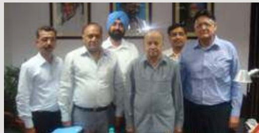
Union Minister for Steel, Virbhadra Singh with CII delegation