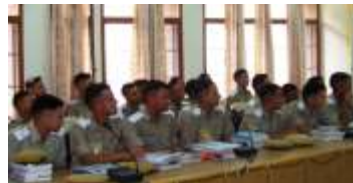
Deputy Superintendent of Police and Sub-Inspectors of Himachal Pradesh attending a training programme