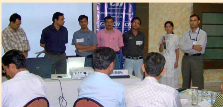
Delegates presenting the task given to them during workshop

The objective of workshop was that people are the core strength of any business and they have the power to build stronger successful organizations. Organizations reflect the collective will of their people. To thrive in today's economy an organization needs to have a group of highly motivated people with positive attitude as its engine. Well-knit & cohesive workforce is the