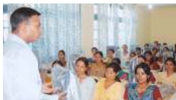
Counselor taking the session during Chetna Counseling Programme

Project Chetna has received encouraging response from the colleges and requests are coming to include more institutes under this. The main objective behind establishing this center was to bridge the existing skill gap prevalent in Himachali youth and make them employable to the private sector.