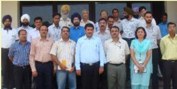
Mission leader presenting the Memento to G S Auto Management during Manufacturing Best Practices Technology Study Mission

A 15 member delegation visited four companies in Ludhiana to learn the best practices in manufacturing.