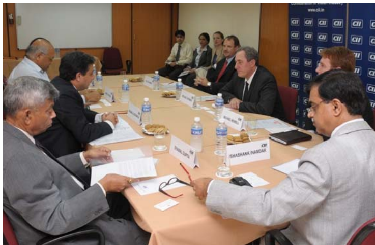
Michael Froman interacts with some Indian industry leaders at CII Mumbai

CII organized an interaction of the Indian business community with Mr Michael Froman , Deputy National Advisor for International Economic Affairs and Special Advisor on Economic Affairs to President Obama and Mr David Lipton , the Special Assistant to the President for Economic Affairs. They interacted with a small group of companies engaged in clean energy and clean technology and learned more about the clean energy landscape in India. Members briefed them on the issues and challenges in growing the clean energy space, and suggested ways in which the US could assist these clean energy initiatives either by way of technology transfer or funding. Indian companies engaged with Mr. Froman in detail, who carries great weight and influence in clean energy policymaking. Discussions revolved around exploring sync areas and partnerships between the two countries in the areas of Solar Energy, Bio-mass, Feed stock for Bio diesel, nuclear energy, clean technology and an overall need for a suitable regulatory framework. Members were apprised of some challenges that would develop for Indian companies, including the availability of VC & tech funds.