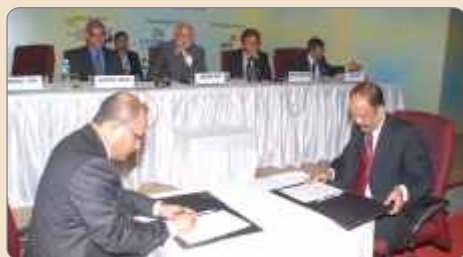
VG 2013 : Innovation Symposium