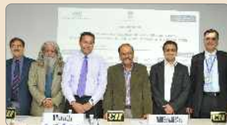
Governing Council Meeting