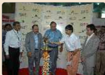
MSME Linkages 2013 : Conference cum Exhibition