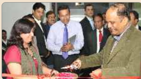
Inauguration of GKAFC