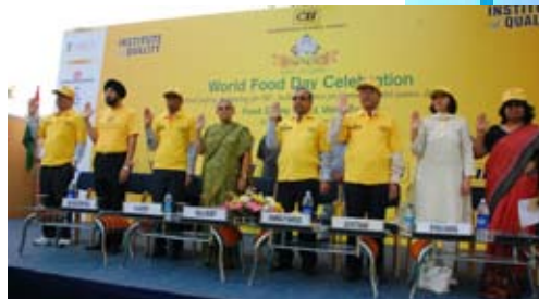
Smt. Sheila Dikshit, Chief Minister of Delhi at the oath-taking ceremony on the World Food Day

Smt Sheila Dikshit, Chief Minister of Delhi flagged off Food Safety Run & Walkathon organised by CII on World Food Day at India Gate, New Delhi. The theme of the event was 'Food Safety & Quality: India Prepares for Commonwealth Games 2010'. CII, through this initiative presented its perspective for safe, hygienic, and quality food availability. This event is an endeavour to brand Indian cuisine as nutritious, healthy and hygienic. An oath taking ceremony was also held to position India as a safe food destination for the upcoming games, by adhering to food safety norms at all food serving establishments and at home. The event was attended by around 2,500 participants including school children, senior citizens, and people from other walks of life.