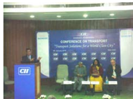
Top: CII's first Core Group meeting in response to Chief Minister's call to find effective, workable road solutions