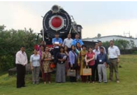
From the top: Award ceremony during the Quality Circle Competition; Mission members at Samsung India Pvt Ltd, Noida; HR Mission Members at Classic Stripes Pvt Ltd, Mumbai