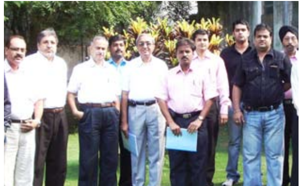
Manufacturing Mission members in Pune

Forge Ltd, Bajaj Auto Ltd (Chakan Plant), Varroc Group of Companies, and Minda Industries Ltd.