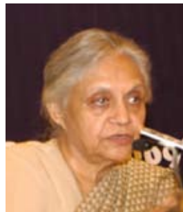
Shiela Dikshit, Chief Minister, Delhi

At a Conference on 'Delhi: A World-Class City in the Making', Mrs Sheila Dikshit, Chief Minister, Delhi, announced that Delhi will host the first-ever Green Commonwealth Games.