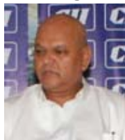
Subodh Kant Sahai, Union Minister, Food Processing