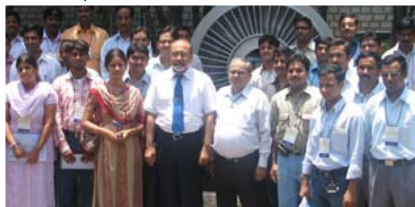
Mission delegates at Voith Turbo Pvt Ltd, Hyderabad

A Best Manufacturing Practices Mission visited Voith Turbo Pvt Ltd & Usha International Ltd to understand the best practices of successful manufacturing companies and provide a platform for sharing success stories within the industry.