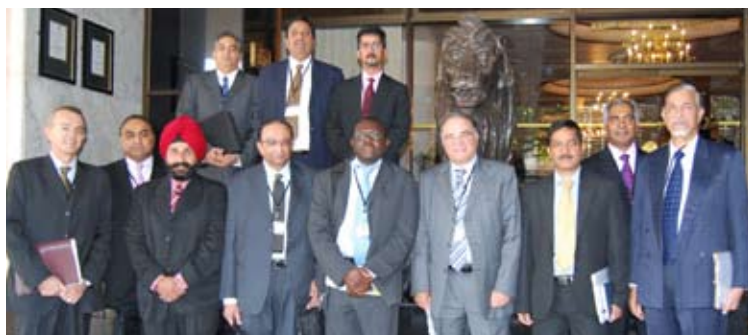
CII delegation to Zimbabwe

The Zimbabwe government assured the CII delegation that serious efforts are being made to develop an investment friendly environment in the country, and stressed that this was the right time for Indian industry to engage with a potential powerhouse.