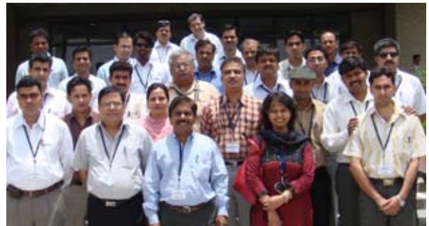
Participants at Samsung during the manufacturing excellence mission

During a one day Manufacturing Excellence Study Mission, 22 professionals from various manufacturing companies across the nation visited the plants of Samsung India Pvt Ltd and Minda Corporation in Noida. These companies have excelled in lean manufacturing.