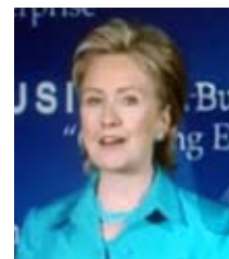
Hillary Clinton, US Secretary of State

Addressing an august gathering at the USIBC Synergies Summit on 17 June in Washington DC, US Secretary of State, Hillary Clinton vowed to work towards a dramatic expansion of the US India agenda and make it a ‘personal priority’. Since the end of the Cold War era, closer cooperation was initiated by President Bill Clinton, which was