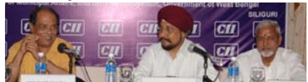
Seminar on Present Economic Scenario