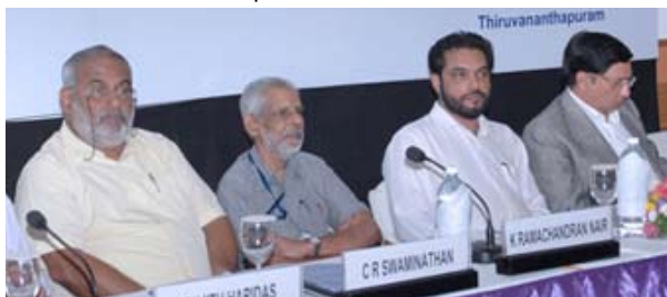
Round-table on Infrastructure

A round table was held to facilitate discussions on the scope and opportunities of public private partnership in urban infrastructure with particular reference to investment, implementation, operation and management of facilities, capacity building, technologies, etc.