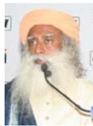
Sadhguru Jaggi Vasudev, Founder, Isha Foundation