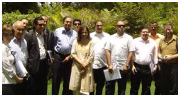
Meeting with Media from Arab Countries

to global and regional terrorism, the role and contribution of India in the sub-continent, the future prospects of India and Gulf commercial and economic relationship, factors contributing to India's economic growth, and the effect of the global financial crisis on India, etc.