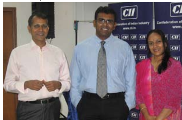
At the road show on CII Services