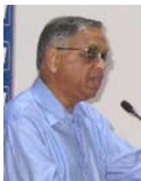
N R Narayana Murthy, Chairman & Chief Mentor, Infosys Technologies Ltd