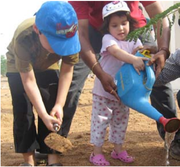
Children at the Tree plantation drive in Hyderabad