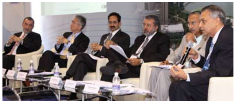
Session on the 'Business of Water in India'

The Education Fair facilitated the sharing of information on the various higher education opportunities available in India that students in Malaysia could benefit from, and also provided a forum for discussion on partnership arrangements between Indian and Malaysian entities.