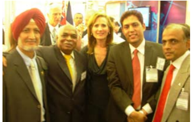
CII Delegates with Sandra Pupatello, Minister of International Trade and Investment, Ontario