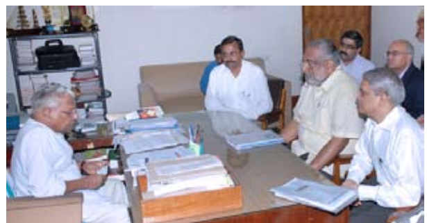
CII members with V S Achuthanandan, Chief Minister, Kerala