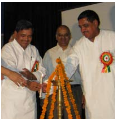
Inauguration of Ground Water Conference

and Magsaysay awardee from Tarun Bharat Sangh, said that though Uttar Pradesh was gifted with immense land water resources and has one of the largest irrigation systems of the world, areas like Bundelkhand still faced severe drought conditions due to poor management of water resources.