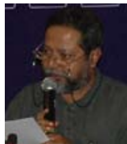
Manabendra Mukherjee, Minister, Tourism, Textiles and Micro & Small Scale Enterprises

CII (ER) in association with the Department of Tourism, West Bengal organized a Government – Industry Interaction to focus on promoting tourism in the state, and work together to promote West Bengal as a prime tourism destination. Mr Manabendra Mukherjee, Minister, Tourism, Textiles, Micro & Small Scale Enterprises, West Bengal, addressed the gathering.