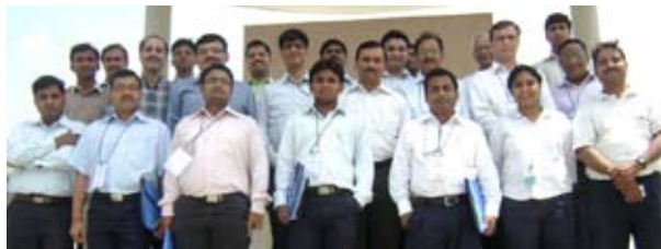
Mission Members during the plant visit to Bajaj Auto Ltd

A Manufacturing Innovation Mission visited Tata Motors Ltd, Thermax Ltd and Bajaj Auto Ltd, in Pune to study the best manufacturing practices adopted by these companies in various fields such as TPM, TQM, SCM, and Energy Conservation.