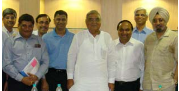
Bhupinder Singh Hooda, Chief Minister, Haryana, with the CII Delegation