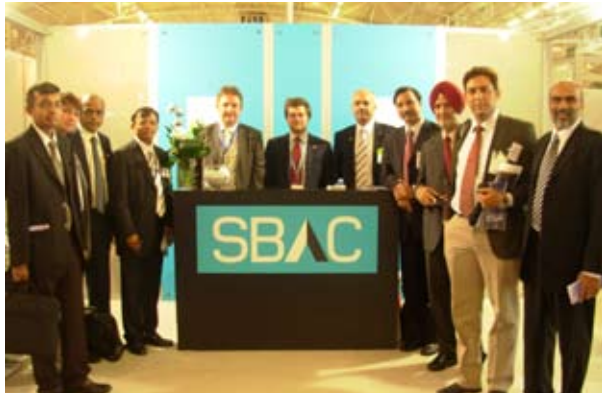
The CII Delegation to the Paris Air Show at the SBAC (UK) stand

This Defence Mission was especially relevant in the era of the opening up of the Indian economy to 26% FDI in