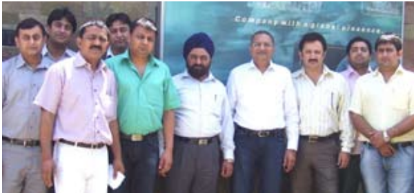
CII-Eastman Vendor Cluster kick-off at Ludhiana

So far, 153 clusters impacting 1232 companies have been formed.