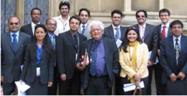
Yi UK Mission delegates with Lord Meghnad Desai at the House of Lords