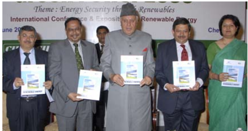
Dr Farooq Abdullah, Union Minister for New and Renewable Energy, releasing the 'case study booklet on Renewable Energy' at Green Power 2009