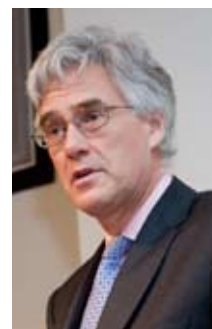
Lord Adair Turner, Chairman, Financial Services Authority, UK

They also met with the Commonwealth Business Council to discuss 'Financing Mergers and Acquisitions: Post Crisis.'