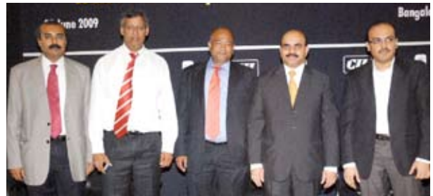
Seminar on IFRS, Bangalore

Conducted in association with PricewaterhouseCoopers, the seminar highlighted the benefits of the proposed convergence with IFRS by April 2011. The IFRS financial reporting framework is truly global in nature and is expected to provide enhanced access to capital markets globally and facilitate inter-firm comparisons on a more even keel than ever before.