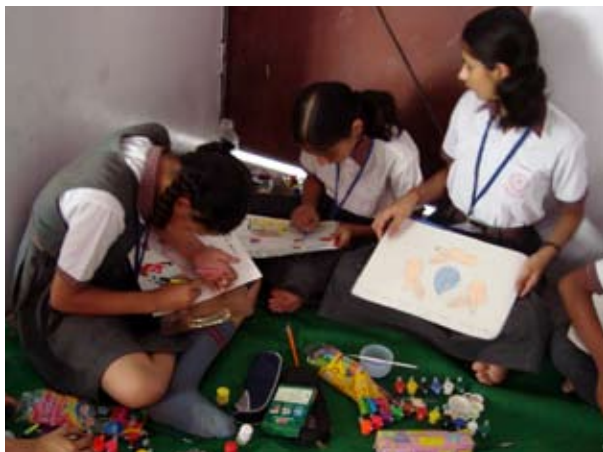
Poster making competition

To mark World Environment Day, the CSR panel of CII Himachal Pradesh State Council organised a series of poster making competitions on Water Conservation. Over 200 school students from Shimla, Barmana and Nalagarh, used their imagination and creativity to spread colourful messages to conserve water. The winning entries have been printed and circulated among the industries, government offices and institutions.