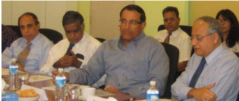
CII-IBF Singapore members with S Iswaran, Senior Minister of State, Ministry of Trade & Industry, Singapore