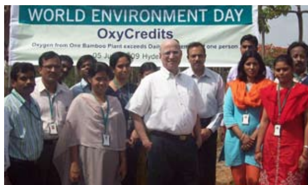
World Environment Day in Andhra Pradesh

In Andhra Pradesh, CII, in association with APTDC, organized a Bamboo Plantation Drive, planting over 4500 bamboo saplings in 16 organizations. It is believed that bamboo, if planted on a mass scale, can completely reverse the effects of global warming in just 6 years and create a renewable source of eco-friendly building